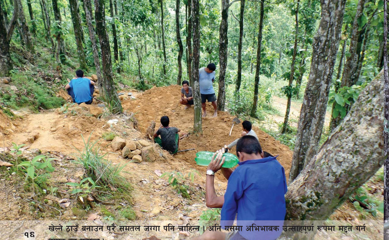
तयार हुन सक्छन्।